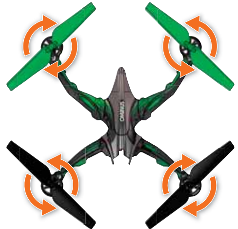
REAR Black Blades, White LEDs